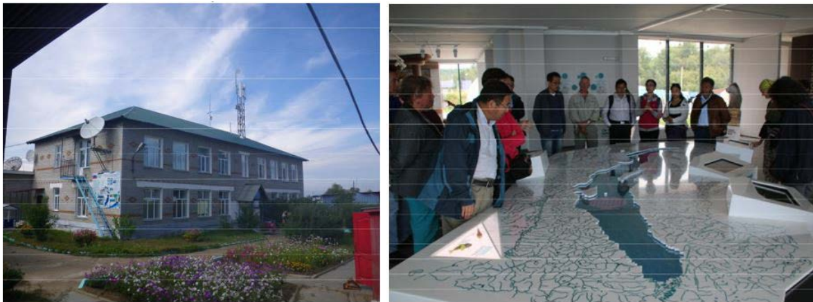
Left, Istomino Baikal Research Center. Right, At the visitor centre near Tanchoi

As usual, participants from the host country and from countries in close proximity are accounting for the majority of speakers. Yet, with papers from North America, Europe, South Africa and Mongolia the conferences managed to achieve a significant degree of geographical coverage.