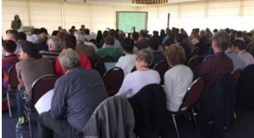
Virginie Mahmaddou opening the Conference during the initial Plenary Session

The theoretical and analytical level of presentations was very high, and it was interesting to see how scholars, besides those who already worked on the topic, were able to re-examine their research within the framework of peace.