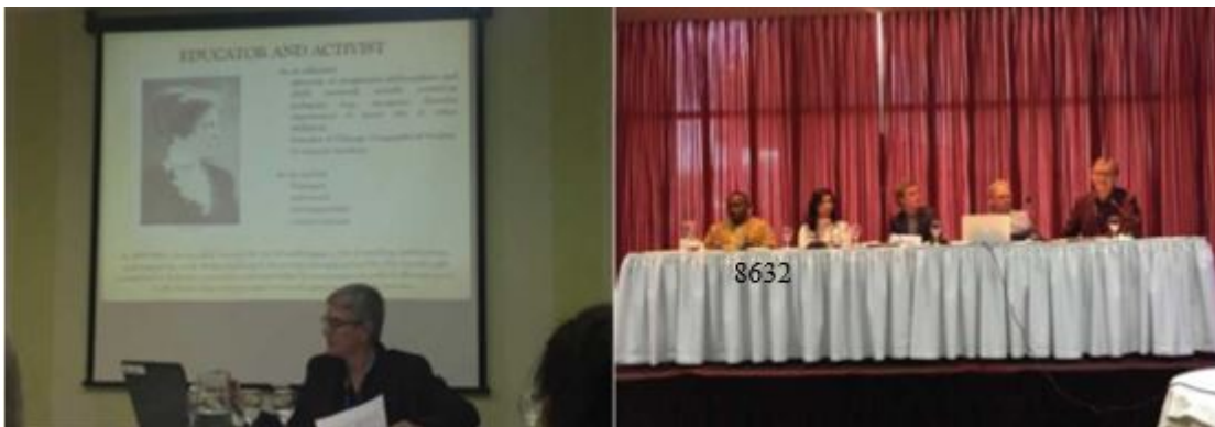
Images from the parallel sessions

The theoretical and analytical level of presentations was very high, and it was interesting to see how scholars, besides those who already worked on the topic, were able to re-examine their research within the framework of peace.