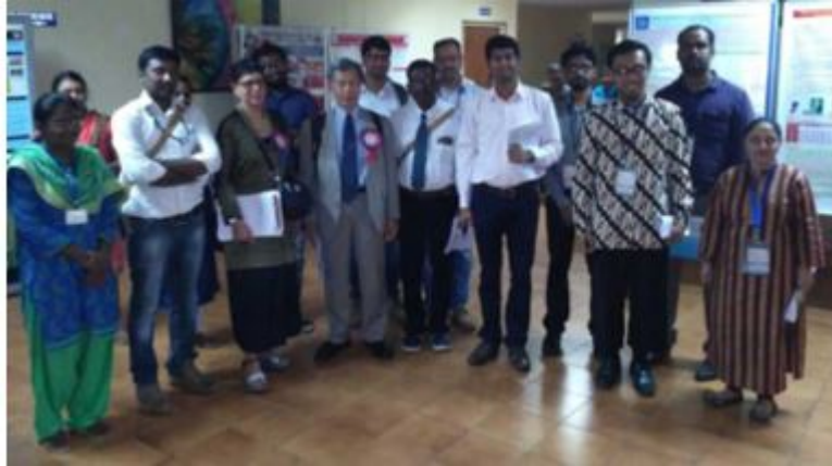
Participants of IGU-YECG Poster Award with jury and IGU-YECG representative