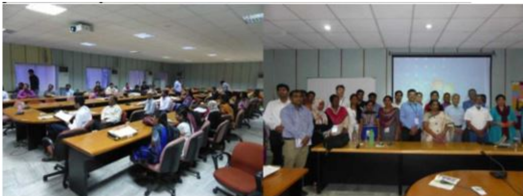
Left: SWAT special session at IGU India Thematic Conference, Right: Hyderabad. Valedictory Ceremony