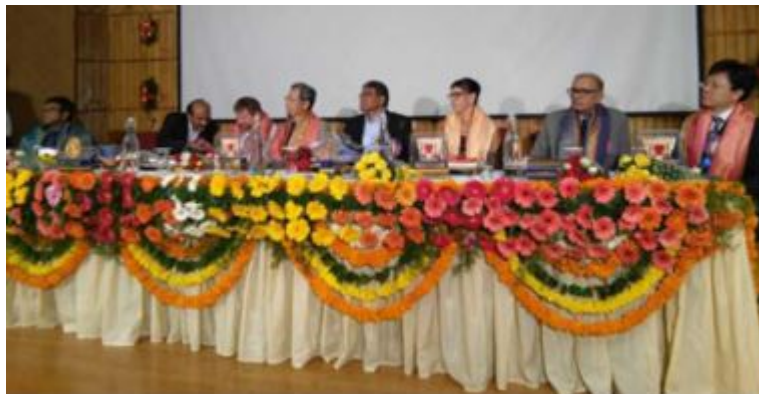
Inaugural Session at IGU, Hyderabad

with Air-Water Quality Induced Challenges for Urban Health and Wellbeing: Application of Systems Approach in South Asian Cities has been planned.