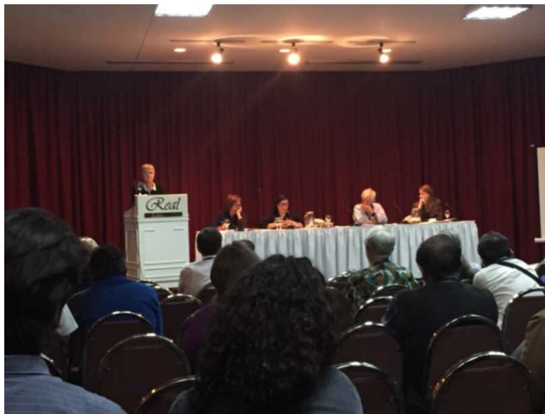
The Final Plenary Session

The relatively small size of the conference, together with its openness in terms of approaches and areas of study, made it a very successful event, socially enjoyable and rich in contents. People could easily meet and discuss during and after the sessions, and this encounter was also facilitated by the participation in the different field trips proposed by the conference organizers, especially the cable-cab tour held on the morning before the conference opening, which saw a large participation and especially the cable-cab tour held on the morning before the conference opening, which saw a large participation and was the occasion to know the social and geographical history of La Paz and El Alto.